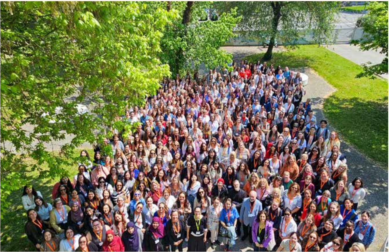
Group Photo April 2026